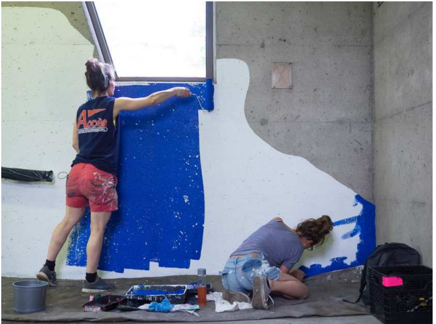
Painters get started on a $25,000 mural at Valois train station in Pointe-Claire in July 2016.

Published on: July 13, 2016 | Last Updated: July 13, 2016 7:57 AM EDT